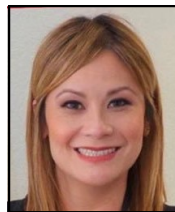
Senator Ling Ling Chang 29th District