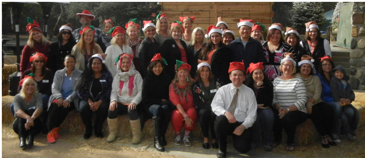
Our December Fourth District PTA Meeting at Irvine Regional Park—Happy New Year to All!

Finally arts programs are being recognized as an integral and important part of a child's education. In spite of this good news, however, school districts are under no obligation to include the arts or increase their arts education program. Now it is up to each of us to insure that arts education is given its due in our school district's Local Control Accountability Plan (LCAP).