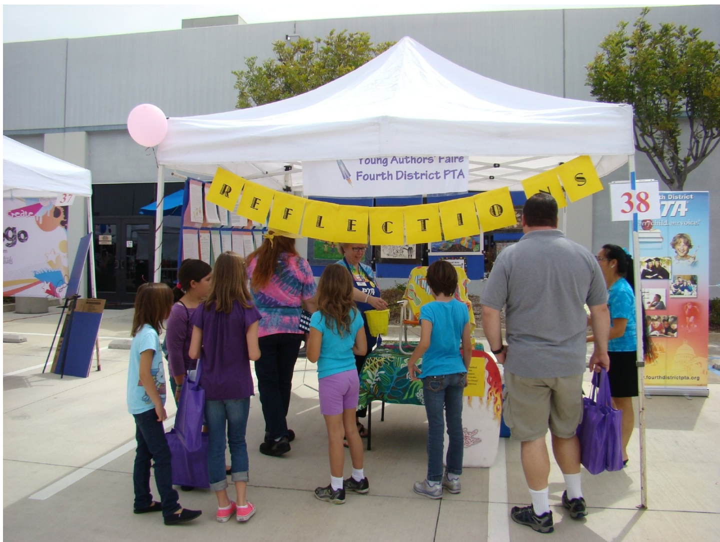
The Fourth District PTA Cultural Arts Committee promoted our Reflections Program at the OC Young Authors Faire, which took place on Saturday, May 19, at the Orange County Department of Education.